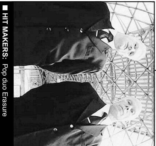
HIT MAKERS: Pop duo Erasure

You can catch them at Flying Circus from 8pm. For more visit www.myspace.com/suzi_won